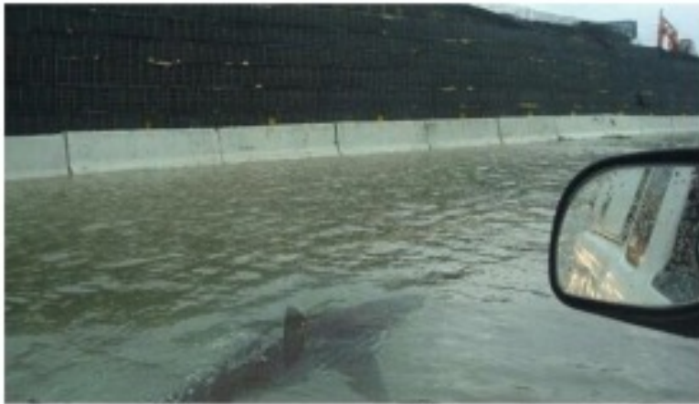
A faked photo allegedly from a flooded street in Houston has been used online since 2011.

There are no sharks swimming in the streets of Houston or anywhere else